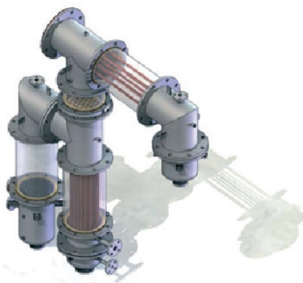
DeSol –laboratory prototype.

The initial developments are completed. The system has been transferred from the two laboratories in Fraunhofer Institute of Physics, Stuttgart and CRIC-Wattpic, Barcelona and jointly installed near