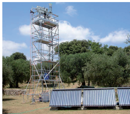
DeSol test set-up.