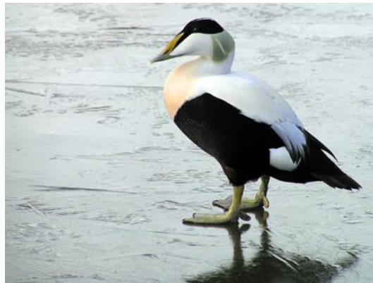
Eider duck Somateria mollissima