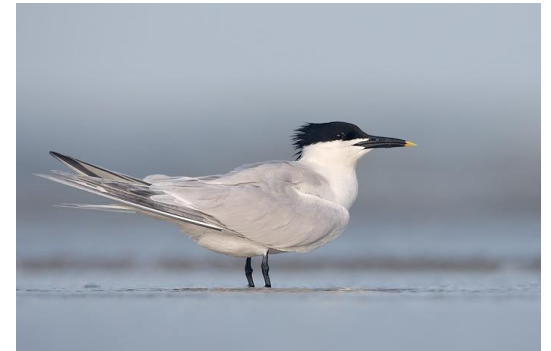
Sandwich tern Sterna sandvicensis