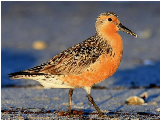
Red knot Calidris canutus

What is the effect of sea level rise on the migratory birds and their nutrition on foraging grounds and breeding grounds on the Dutch Wadden Sea?